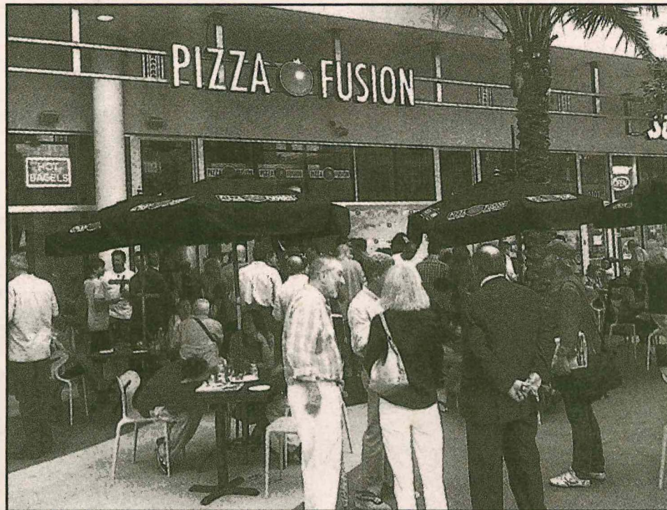
Crowds gather for an early dinner on 5th Street and Alton Road

The activation of 5th Street and Alton Road where over 100,000 vehicles drive by daily according to Michael Berkowitz, took eight years to accomplish with many roadblocks slowly surmounted over time. Approval by the Department of Transportation zoning for outdoor seating, multiple design and redesign reviews by at least ten different architects, historic preservation clearance and art in public